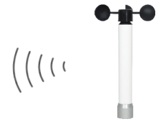
WINDY B/S - wind speed sensor