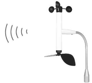
WINDY B/SD - wind speed and direction sensor